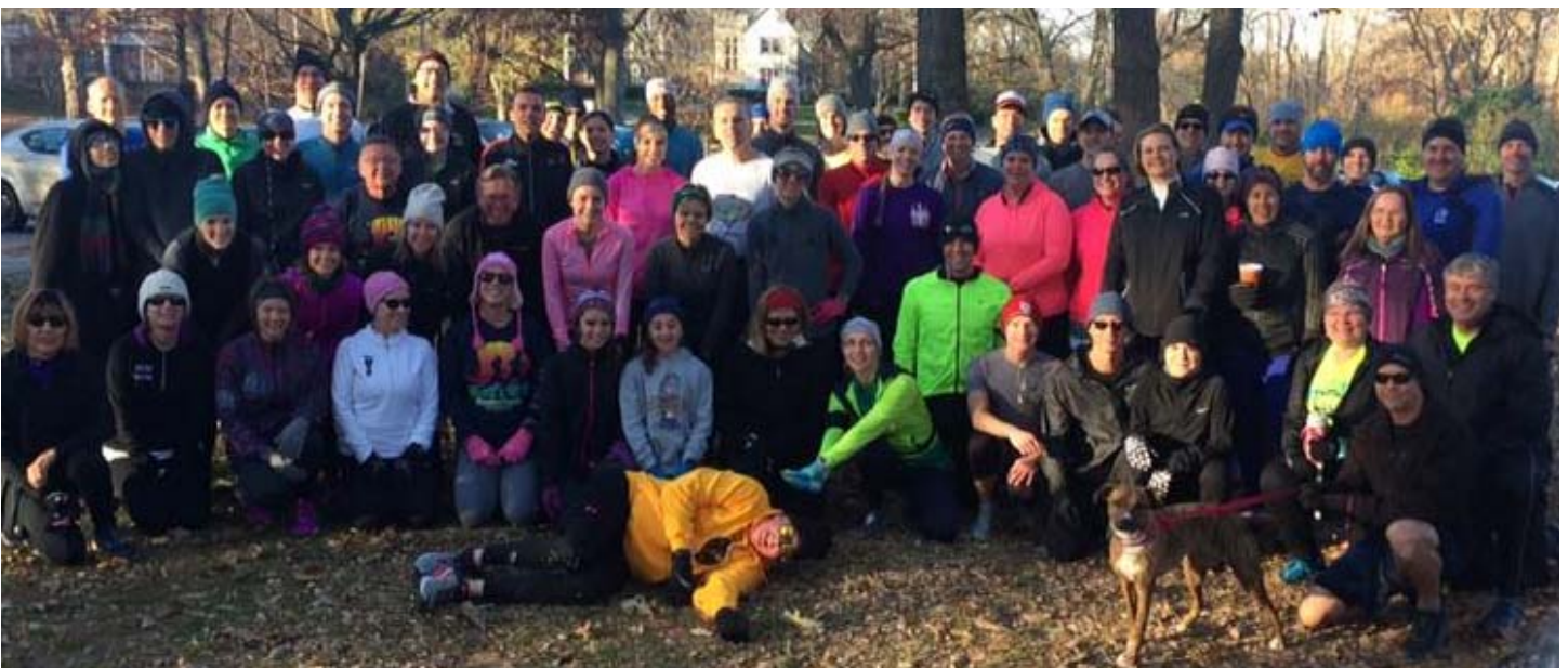
Top row: SRRC Members at Shoreline Classic. Middle row: (L) Checking out the new SVT trail extension with FrostToes, (C) Celebrating a first half marathon finish, (R) SRRC at Canal Connection. Bottom row: Cold Duck Run on Thanksgiving morning.