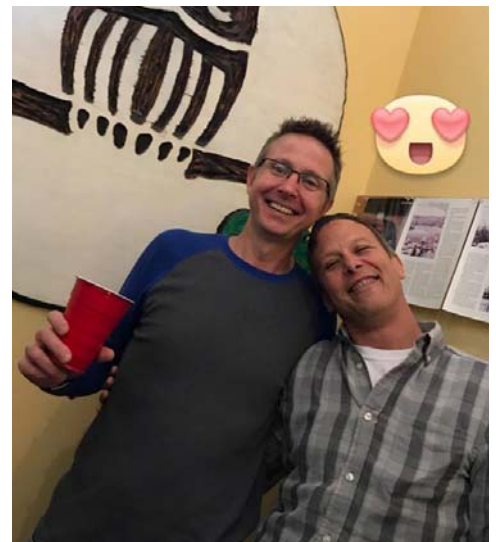
Some photos from the SRRC Wine Bus Social to Southern Illinois vineyards in October.